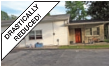
143-145 Blue Lick - $169,900 This return is better than the stock market or your CD's.. Well maintained, rural setting, almost always fully rented. Start thinking about retirement now, and schedule your private showing today!