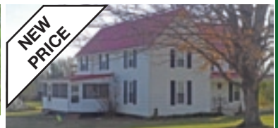
2529 Doylesville Road - $244,900 Country charm at its best! With all the updates in this unique farmhouse, the country feeling and appeal have not been compromised. 11.59 acres Call today for your private showing.