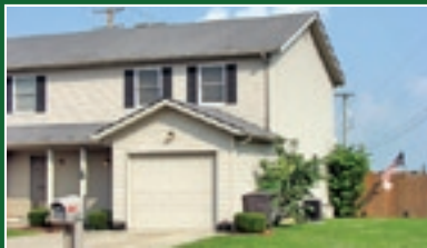
293 Redwing Drive - $89,900 2 bd, 2-1/2 bath Townhome, ready to move into. Fenced in backyard. Call for your appt. today!! 1 year warranty.