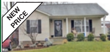
29 Dan Turner Rd - $69,900 I would love to show you this cozy 2 bedroom bungalow with all the city conveniences. Only five years old, this home is like new. One year home warranty provided. Conveniently located in town. Call for your private showing today.