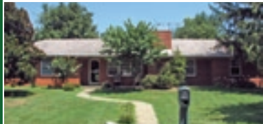
125 Rebecca Drive - $124,900 Room to roam and secluded at that in the middle of town! Come see for yourself!! Needs some tic. 3bd 2 1/2 bath, ranch on basement on cul-de-sac. Call today for your private showing!! 1 year warranty.